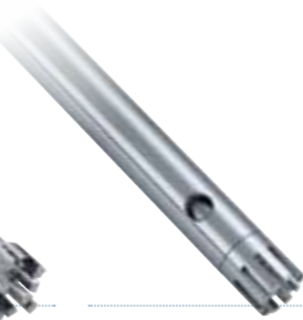
S 25 KV - 18 G Dispersing element

Ultimate fineness, suspensions: 10 – 50 µm Ultimate fineness, emulsions: 1 – 10 µm