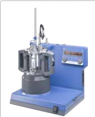
LR 1000 basic Package