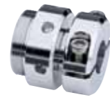
LR 1000.41 Shaft receptacle

To install the dispersing elements S 25 KV Material of seal: FKM