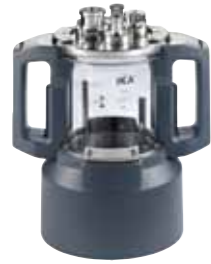
LR 1000.1 Laboratory reactor vessel