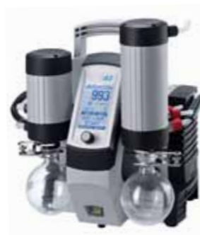
SC 920 Vacuum pump

The SC 920 vacuum pump system supports remote control over a portable hand terminal, thus ensuring maximum flexibility in the laboratory