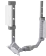
LR 1000.10 Anchor stirrer with PTFE scrapers

Min. usable volume when homogenizing: 500 ml