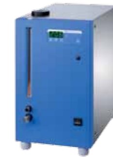
KV 600 digital

KV 600 digital is an air-cooled chiller with a small footprint, a large temperature display and a temperature accuracy of ± 1 K