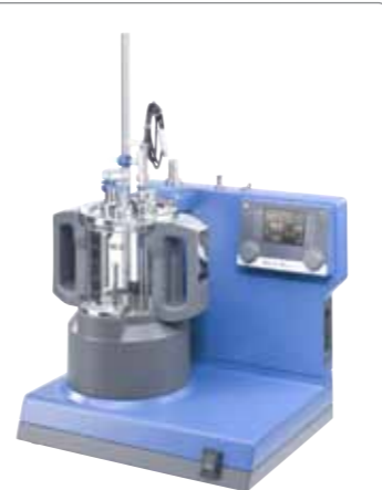
LR 1000 control Package