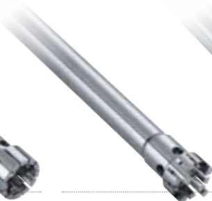
S 25 KV - 25 G Dispersing element

Ultimate fineness, suspensions: 15 – 50 µm Ultimate fineness, emulsions: 1 – 10 µm