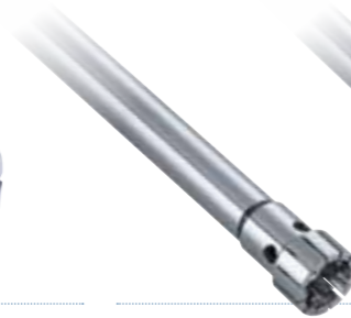
S 25 KV - 25 F Dispersing element

Ultimate fineness, suspensions: 5 – 25 µm Ultimate fineness, emulsions: 1 – 5 µm