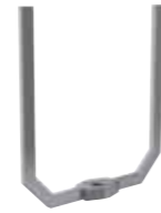
LR 1000.11 Anchor stirrer

Min. usable volume when homogenizing: 300 ml